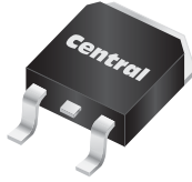
D 2 PAK CASE

SURFACE MOUNT SILICON CONTROLLED RECTIFIERS 25 AMP, 600 THRU 800 VOLT